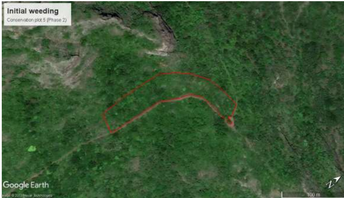
satellite map showing Conservation Plot 5 (Phase 2)

The exact location of work areas will be indicated by the Client on site. The contractor will be required to carry out site visits with the client to clearly identify indicated locations and mark areas spotted for restoration and conservation works. The contractors should cater for their own transport facilities to carry out site visits.