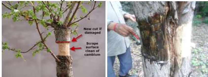
Illustration of Ring Barking