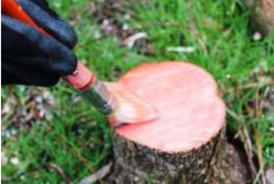
Illustration of cut stump