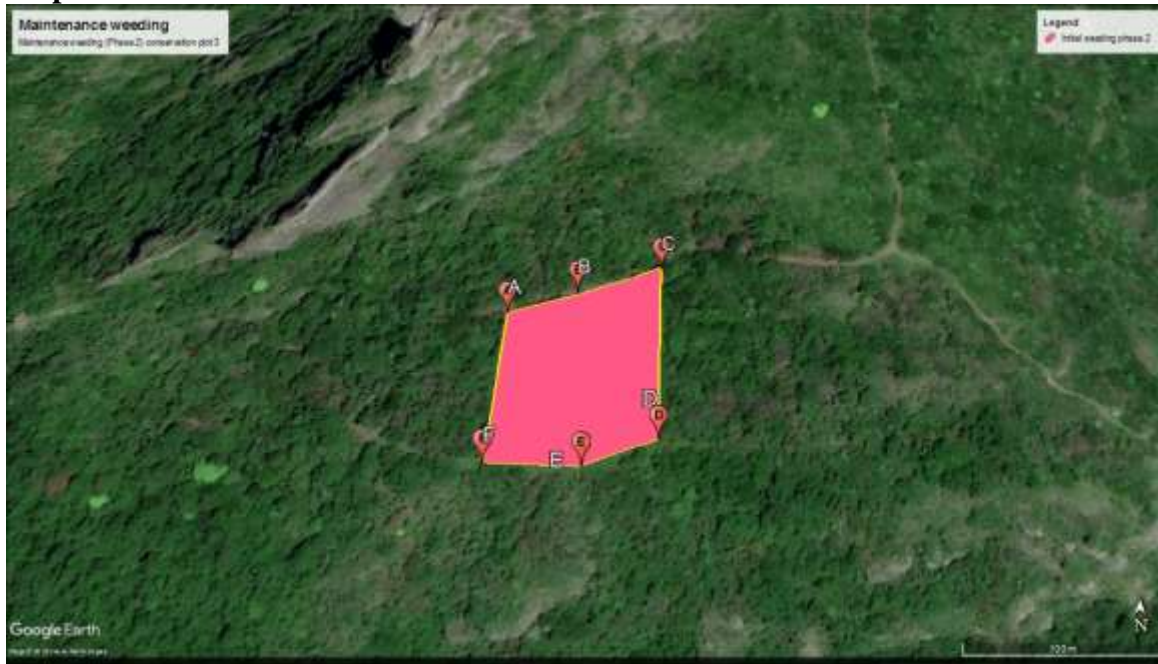
Satellite map showing Conservation Plot 3 (Phase 2)