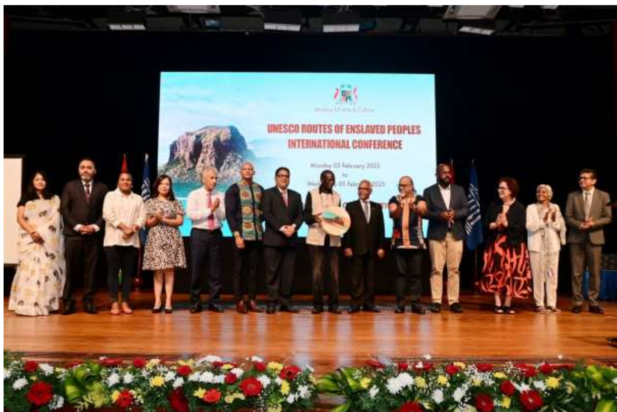
Figure 7: Group Photo: International Conference on UNESCO Routes of Enslaved Peoples in the Opening Ceremony