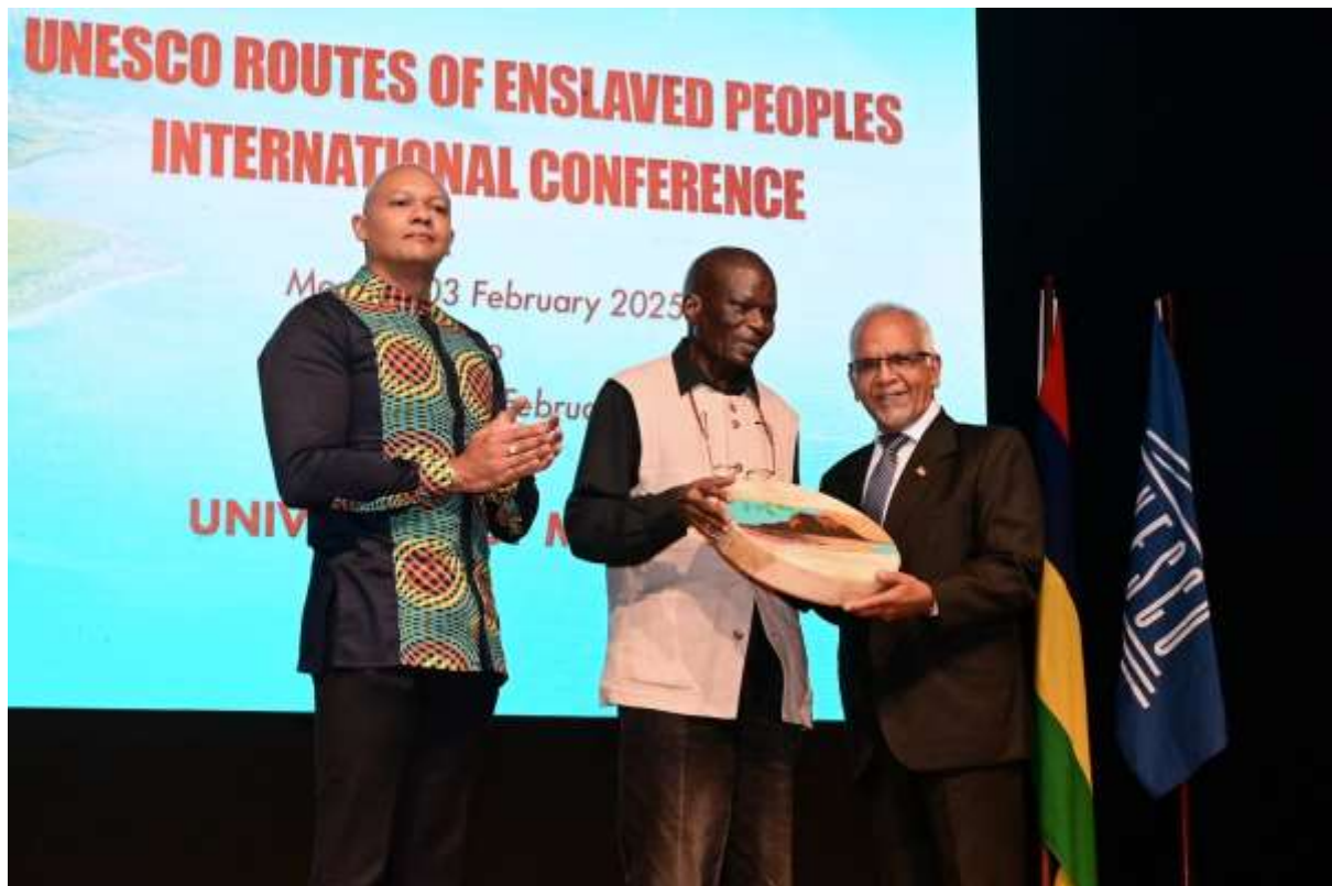
Figure 6: Remittance of gift to Mr Doudou Diène, Conceptor of the Routes of Enslaved Peoples by H.E Mr Dharambeer Gokhool, GCSK, President of the Republic of Mauritius in the Opening Ceremony