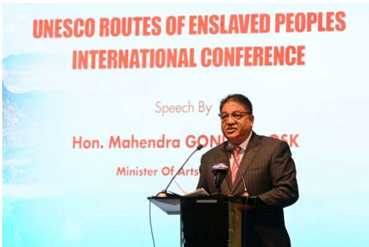
Figure 4: The Hon Mahendra GONDEEA, OSK, Minister of Arts and Culture addressing the audience in the Opening Ceremony