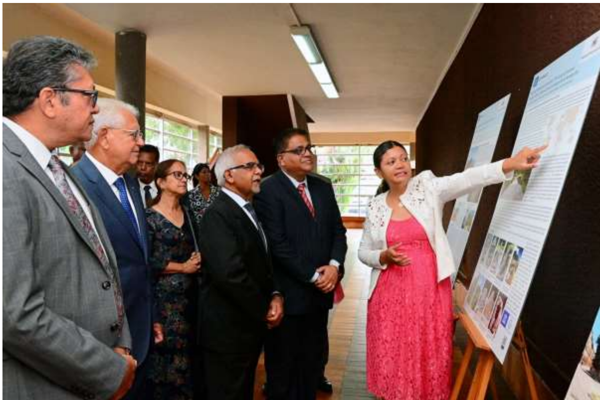
Figure 1: Poster Exhibition- Sites of Memory in the Southwest Indian Ocean