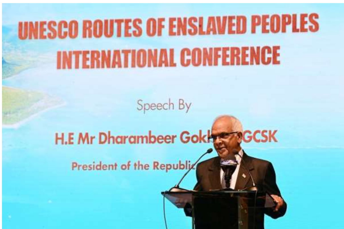
Figure 3: H.E Mr Dharambeer Gokhool, GCSK, President of the Republic of Mauritius addressing the audience in the Opening Ceremony